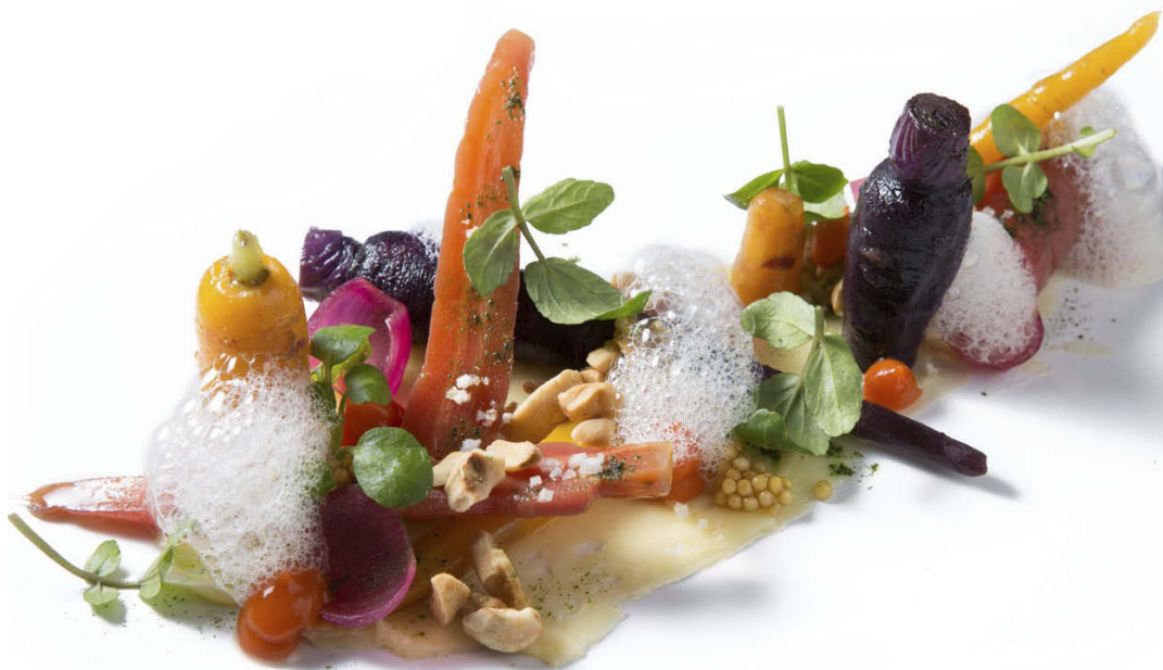
CARROT SFORNATO, FERMENTED SHALLOT, MARCONA ALMONDS, PROSCIUTTO - ACQUERELLO