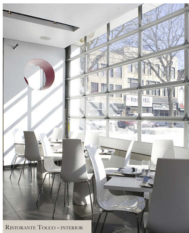
RISTORANTE TOCCO - INTERIOR