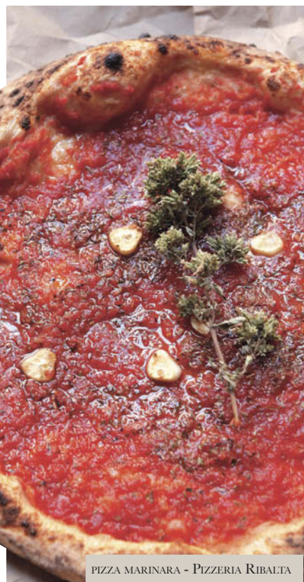
PIZZA MARINARA - PIZZERIA RIBALTA