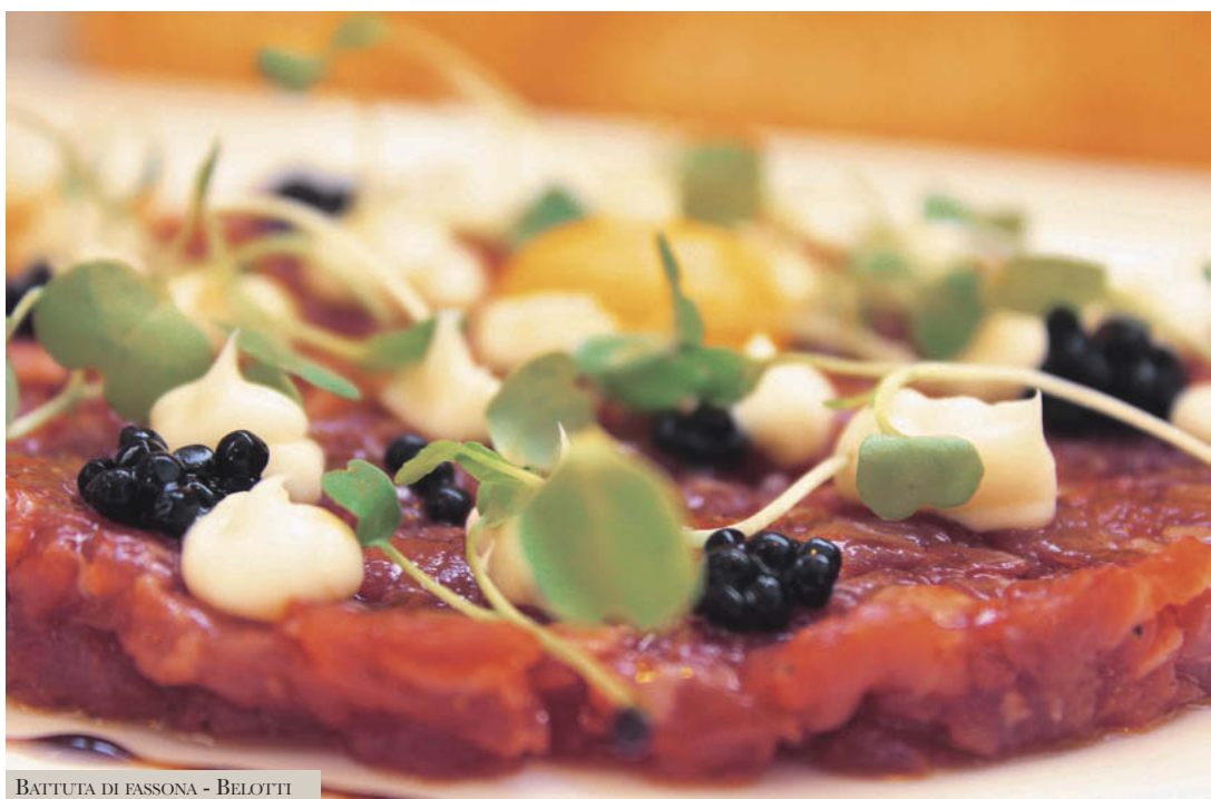
BATTUTA DI FASSONA - BELOTTI